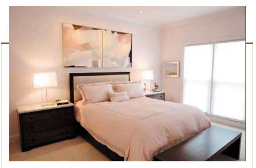
Minta Bell shares her tips about the most romantic room in the house - the bedroom.

What are some of the best ways to breathe life into a master bedroom?