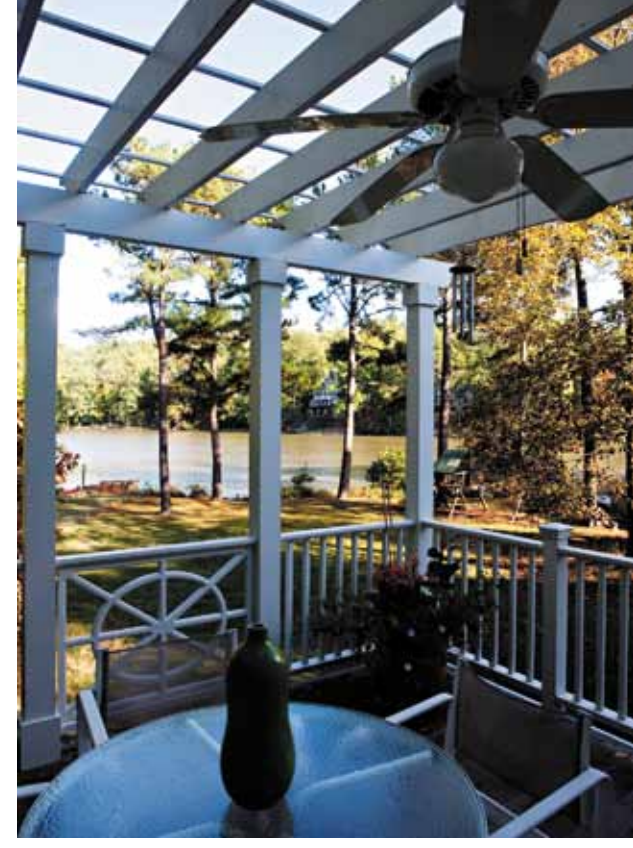
TOP AND BOTTOM LEFT: The maple bookcases from CKS Kitchens and Design in Durham are stained a "mild, modified Chinese red," says Zinn. She acquired her oak dining table in the 1970s, but painted the set to achieve a more modern look. And the real eye-catcher of the space is the hickory branch light fixture, which contrasts with the ash floors and kitchen cabinets. BOTTOM RIGHT: Zinn added a large deck to the home, where she often eats dinner.