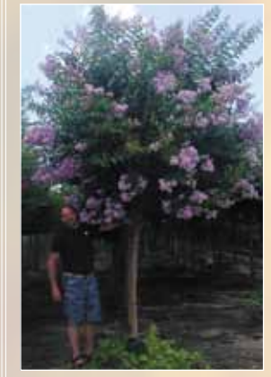
14' Single-trunk 'Muskogee' Crape Myrtle

wanted a tropical theme to Cooper-Payne installed a variety of cold-hardy palms