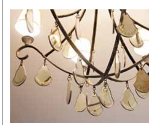
The master bath, now marbled, was expanded, and a steam shower was installed. The light fixture speaks to Zinn's belief that lighting can act as "3D sculpture pieces."

she was drawn to quiet neutrals, almost the color of cream, because life was so hectic. In Chapel Hill, things are relaxing enough on the outside that she likes a mild red bookcase to contrast with yellow-orange walls. (Originally, she had the walls painted a coffee color but found them to be too serious.)